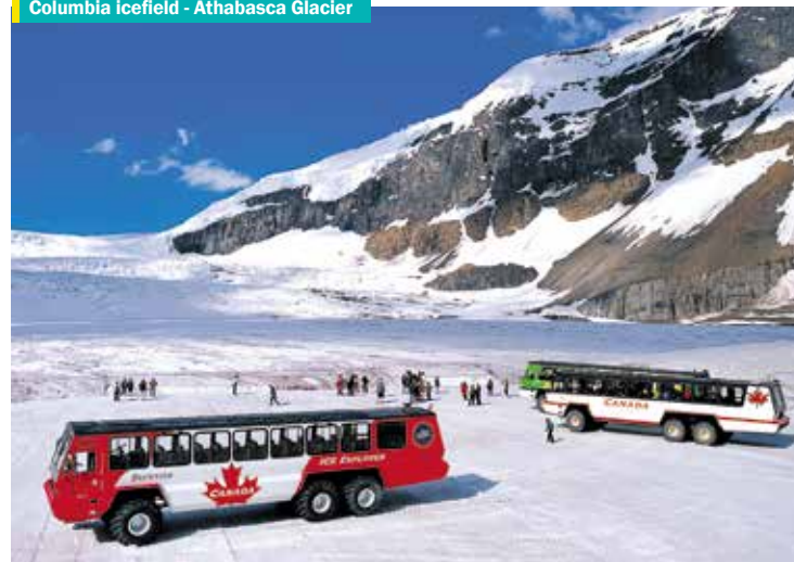
Columbia icefield - Athabasca Glacier

After breakfast, check out and drive towards Columbia Icefields. Enjoy one of the most scenic drives in the world - along the Icefields Parkway - a region with spectacular scenery, from glaciers to waterfalls. Later, get set for the highlight of your tour as you go to the Columbia Icefield – which is more than 100 meters in depth. Here proceed on the Columbia Icefield Glacier Experience which reveals the most unique attraction in the Canadian Rockies. Massive Ice Explorers, specially designed for glacial travel, take